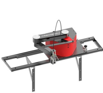
P8994 X2 Large cut indexing system