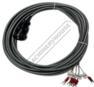
Universal CNC Cable