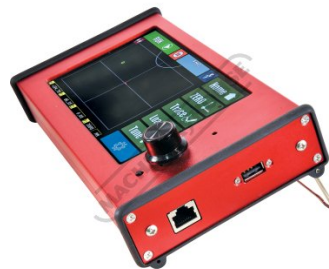
Import Via USB