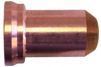
C624 0.9mm Cutting Tips