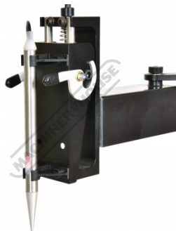
Trace Pen In Holder