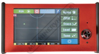
Touch Screen Interface