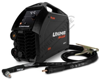
RAZOR CUT 45 V2 - Plasma Cutter