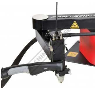
Plasma Torch Cradle