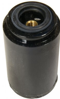
P8081 Hypertherm Elimizer Filter - Replacement filter element