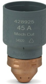
P8232 SmartSYNC™ Cartridge - 45A