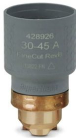
P8231 SmartSYNC™ Cartridge - FineCut©