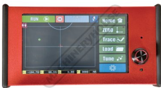
Touch Screen Interface