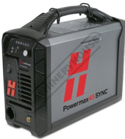
HYPERTHERM Powermax 45 SYNC