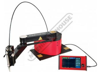
Setup With Trace Stylus