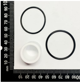
AP0001 Air filter element kit -Internal