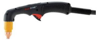
P8066 Hypertherm Hand Torch