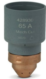
P8233 SmartSYNC™ Cartridge - 65A