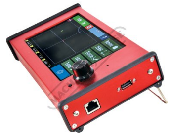
Import Via USB