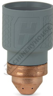
Mech Cartridge RFID Technology