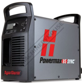
HYPERTHERM Powermax85 SYNC