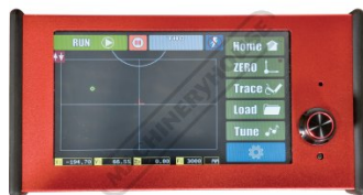
Touch Screen Interface