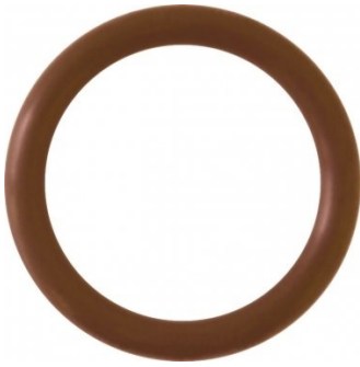
AP0021 Hypertherm O-Ring