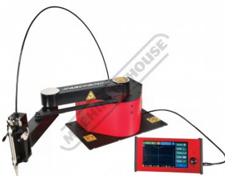
Setup With Trace Pen