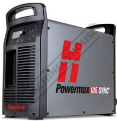
HYPERTHERM Powermax105 SYNC