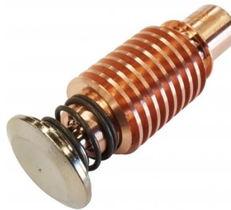
P849 Hypertherm 30-125A Electrode