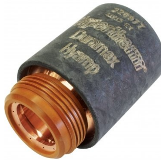
P859 Hypertherm 30-125A Retaining Cap