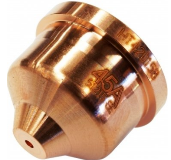
P852 Hypertherm 45A Nozzle