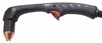
P8064 Hypertherm Hand Torch