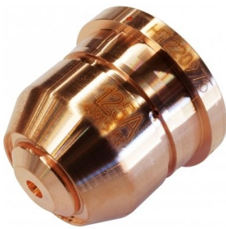
P850 Hypertherm 125A Nozzle