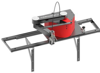
P8994 X2 Large cut indexing system