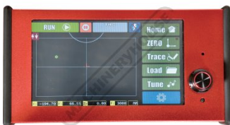
Touch Screen Interface