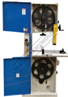
Shown With Blade Door Open