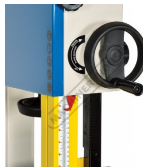
Rack Pinion Adjustment On Top Blade Guide