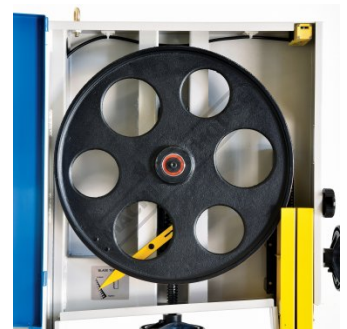
Cast Iron Blade Wheels