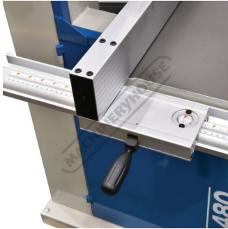
Sliding Rip Fence