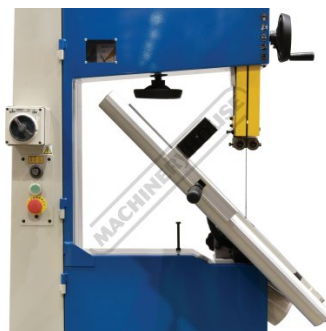
Cast Iron Table Tilts To 45 Degrees