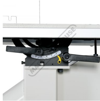
Table Tilt Adjustment