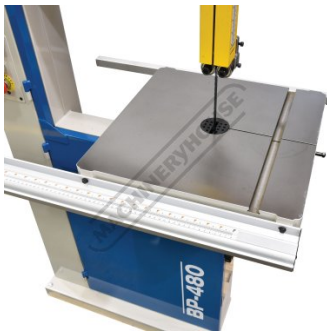
Large Cast Iron Table