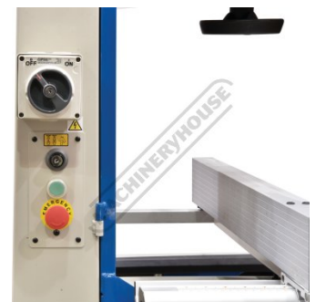
Keyed Safety Switch