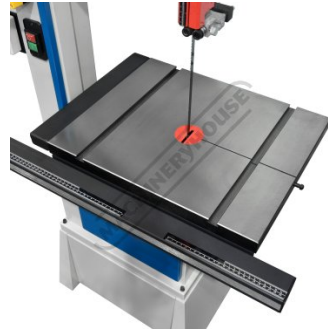
Large Work Table