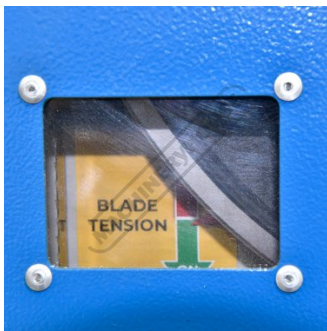
Blad Tensioning Indicator