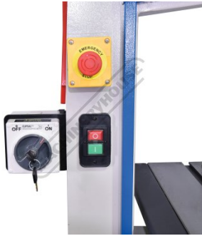
Keyed Isolation Switch