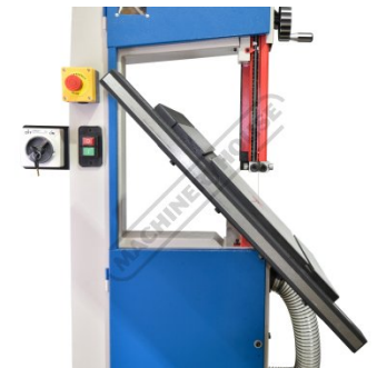
45 Degree Table Tilt