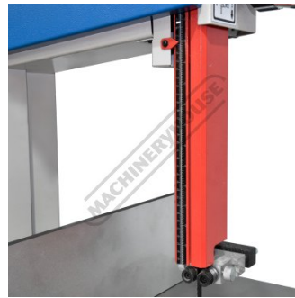
Blade Guard Blade Height Scale