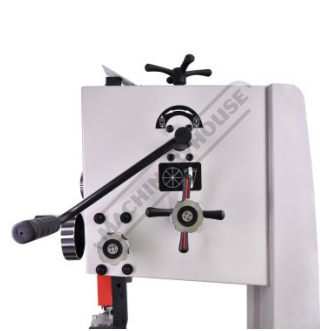
Blade Release Tension Tracking Blade Lock