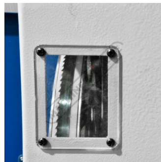
Blade Tracking Side View Window