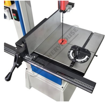
Mitre Guide Rip Fence