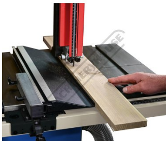
Fence Low Position