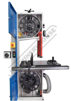
Blade Guards Fitted with Safety Micro Switches