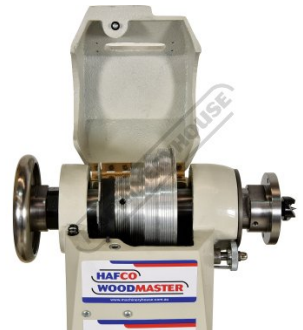
Flip Up Guard for Quick Belt Speed Change