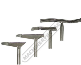
Curved Tool Rest Set W295