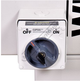
Key Lockable Switch