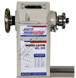
Visible Check Speed Selection