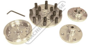
Scroll Chuck Accessory Kit Set W375