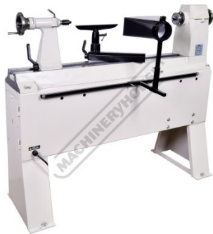
Dust Chute Attachment