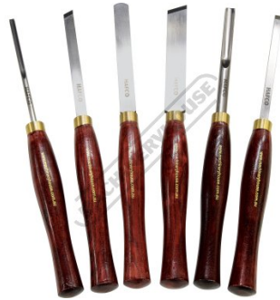
Turning Tool Set W3036