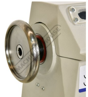
Spindle Hand Brake Wheel