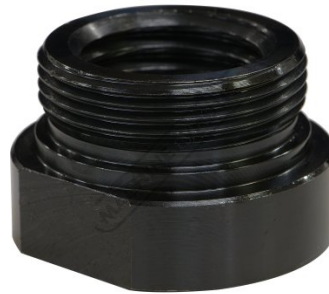
Scroll Chuck Insert W366