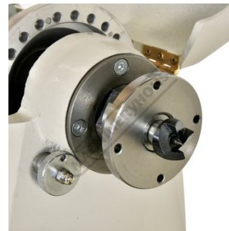
Main Spindle with Drive Spur