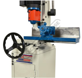
Table movement left and right