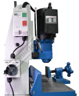
Keyed Isolation Switch