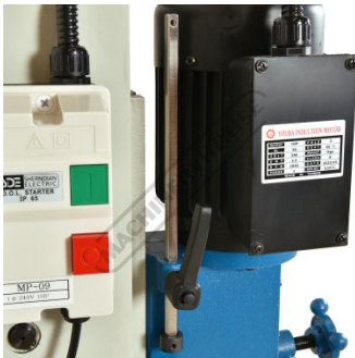
Adjustable depth stop