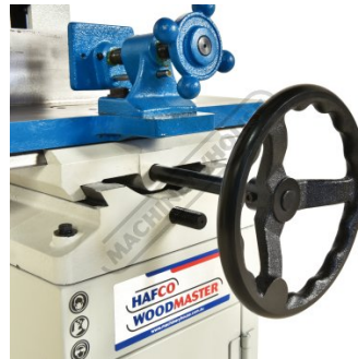
Cross slide and table travel handwheel