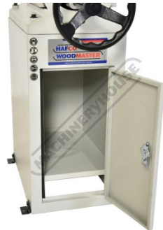
Large storage cabinet