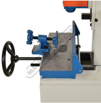
Table Travel heavy duty device