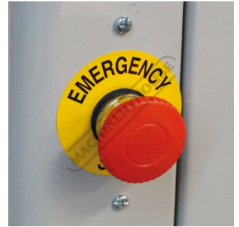
Raised Emergency Stop