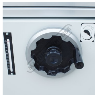
Blade Tilt Handle