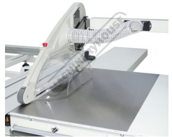
Tilting Blade Guard with Dust Extraction Hose