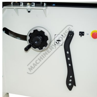
Blade Height Adjustment and Push Stick