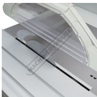
Main Blade with Scoring Blade