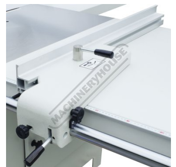
Micro Adjustment Rip Fence