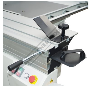
Table Handles and Table Lock