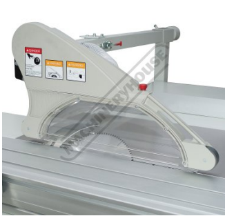
Tilting Blade Guard