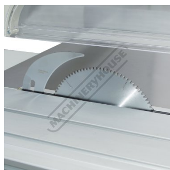
Main Blade Close Up