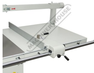
Heavy Duty Rip Fence