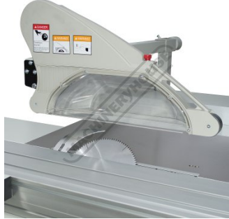
Tilting Blade Guard Raised