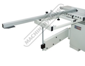
Solid Outrigger Table with Sliding Arm