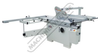
Main View Guard Down