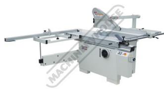
Main View Guard Up