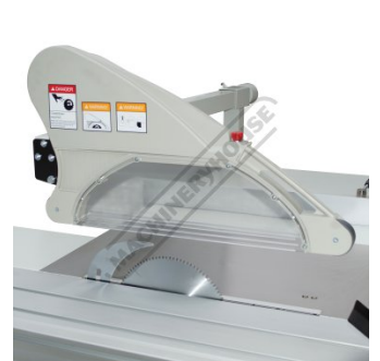
Blade Guard Raised Up