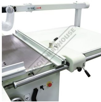
Heavy Duty Rip Fence Shown in Lower Position for Cutting Thin Material