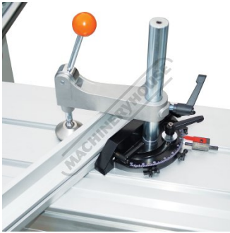
Angle Guide with Material Clamp