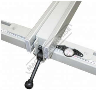
Single Lock Lever on Rip Fence with Magnified Scale