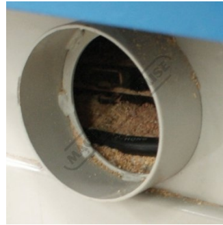
100mm Dust Chute