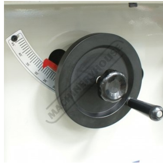
Blade Height Adjustment Handle & Angle Scale