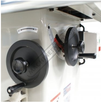
Tilt Arbor to 45 degrees