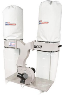
W329 Dust Collector