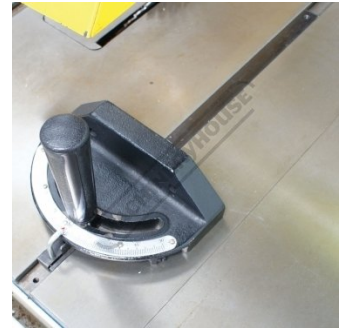
Heavy Duty Mitre Guide