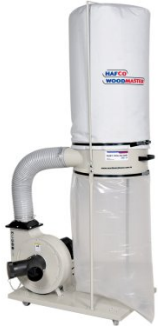
W394 Dust Collector