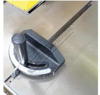
Heavy Duty Mitre Guide