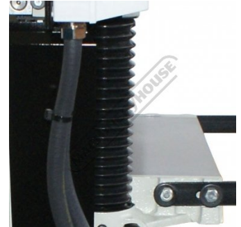
Protective Concertina Covers