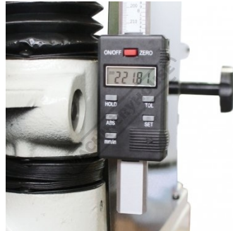
Digital Height Readout