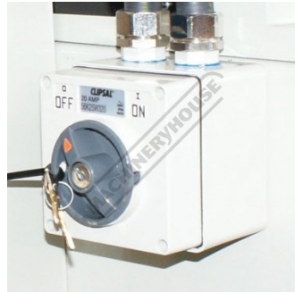
Key Lockable Switch