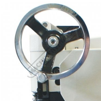
Height Adjustment Handle