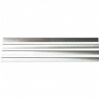
WL005 BLADE SET HSS PKT 4