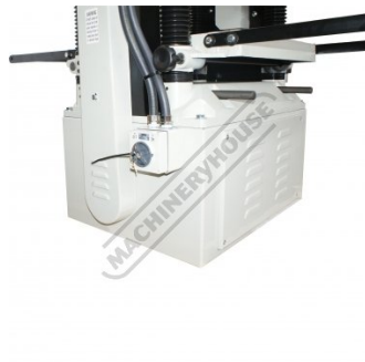
Heavy Duty Base