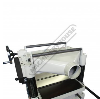
125mm Dust Chute and Top Material Slide Rollers