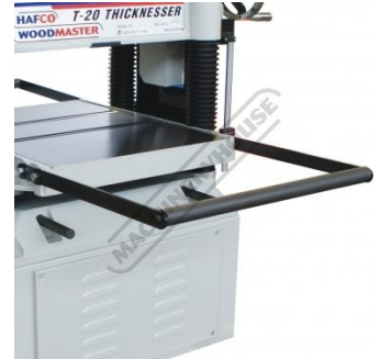
Roller Material Supports