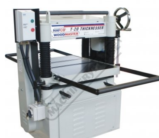
Robust 4 Post Design