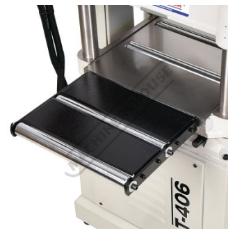
Infeed and Outfeed Tables