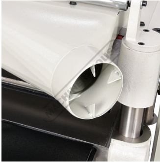
100mm Dust Outlet