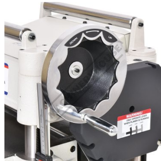
Height Adjustment Hand Wheel