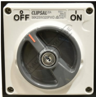
Key Lockable Isolation Switch