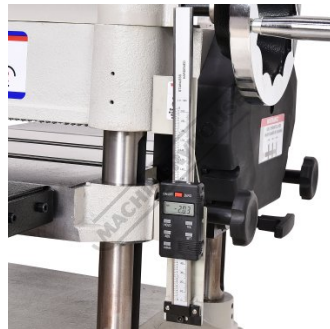
Digital Height Gauge