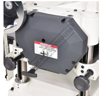
2 Speed Feed Gearbox