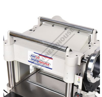
Top Rollers for Returning Material