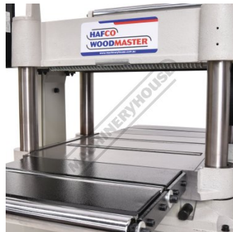
Cast Iron Main Table