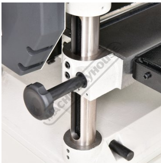
Height Adjustment Lock Handle