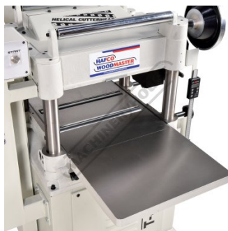
Cast Iron Infeed and Outfeed Tables