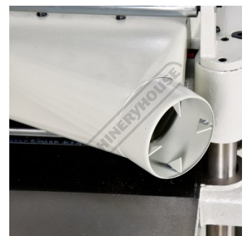
100mm Dust Outlet