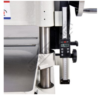
Digital Height Gauge