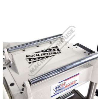
Top Rollers for Returning Material