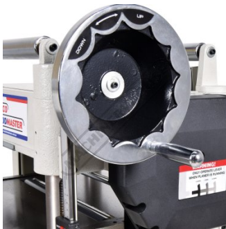
Height Adjustment Hand Wheel