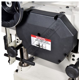
2 Speed Feed Gearbox