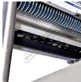
Five Spiral Cutter Head With 80 Inserts