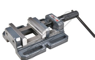
100mm Drill Press Vice