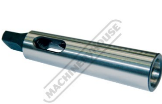
2MT x 1MT Morse Taper Drill Sleeve D420