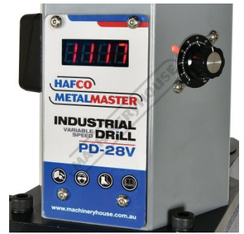
Variable Speed Readout with Adjustable Dial