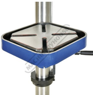
Cast Iron Table Rotates 360 Degree