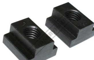
12mm Clamp Tee Nuts C085A