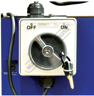
Key Lockable Switch