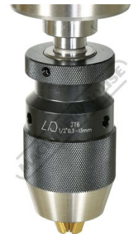
13mm Keyless Drill Chuck