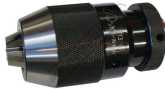
16mm Keyless Drill Chuck C294