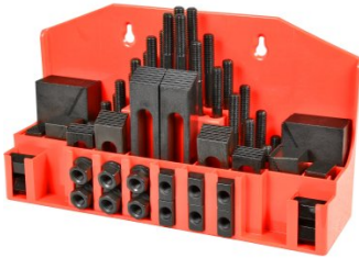
C096A Clamp Kit 58 piece - Industrial Series