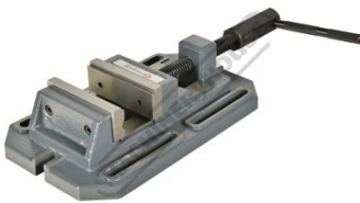
100mm Heavy Duty Drill Vice V1541