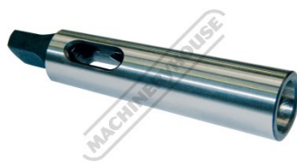
2MT 1MT Drill Sleeve D420