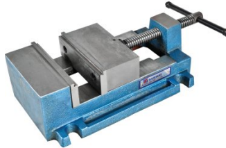
V142 Safeway Precision Drill Press Vice