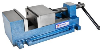
V141 Safeway Precision Drill Press Vice