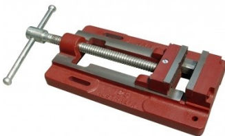
V138 Drill Press Vice