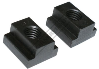
12mm Clamp Tee Nuts C086