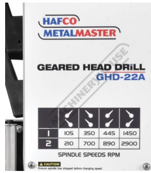
HighLow With Forward Reverse Spindle Speeds