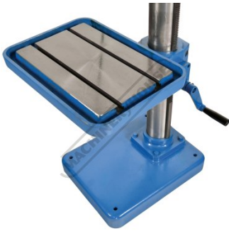
T Slotted Work Table With 360 Degree Rotation