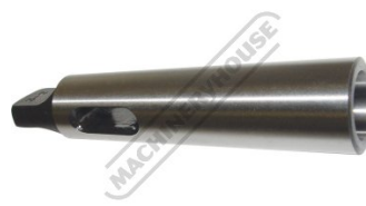
3MT 2MT Drill Sleeve D422