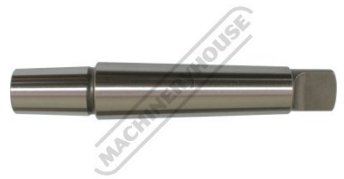
3MT x JT3 Drill Chuck Arbor D443A