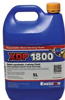
S090 Soluble Metal Cutting Fluid - 5 Litre