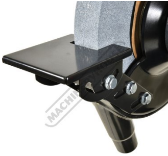
Tool Rest Dust Chute