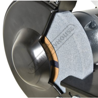
Fine Grinding Wheel