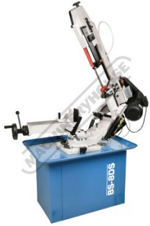
Head Fully Raised