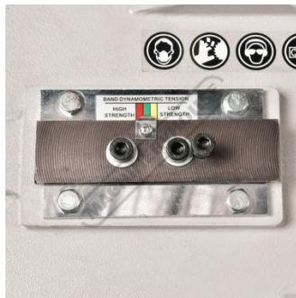
Band Dynamometric Tension Indicator