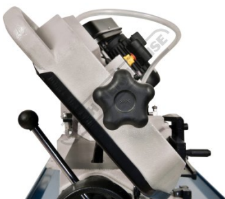
Blade Tension Control