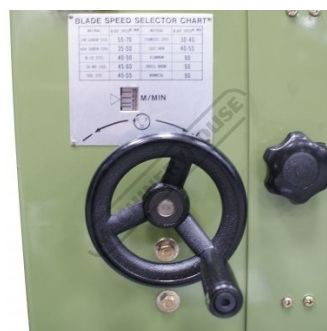
Variable Speed Handle