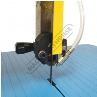
Blade Air Pump