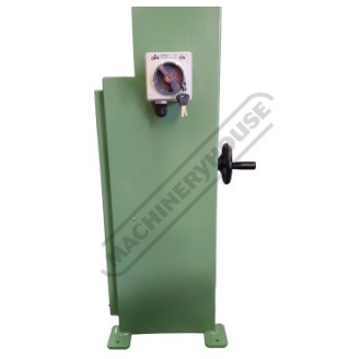
Keyed Isolation Switch