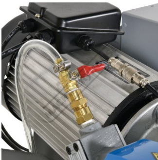
Collant Flow Control Valve