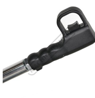
Deadman Trigger Switch