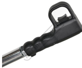
Deadman Trigger Switch