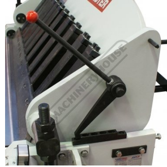
Top Beam Support Stop Lever