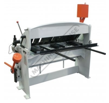
Rear Back Gauge