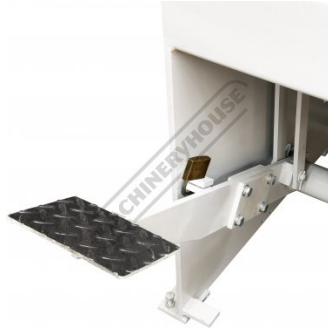
Foot Pedal Lever Shown Locked with Optional Padlock