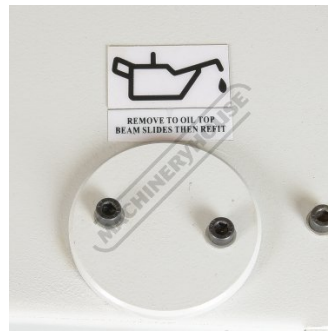
Oil Refil Points