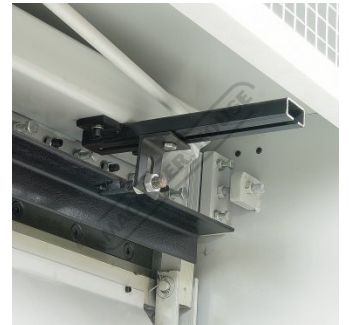
Backgauge Close Up