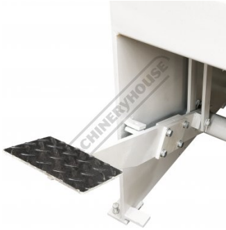
Foot Pedal Lever