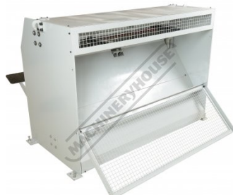
Rear Guard Pivots to Open