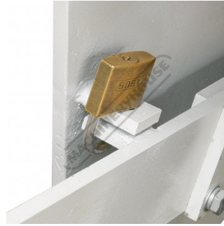
Isolation Tabs Shown Locked with Optional Padlock