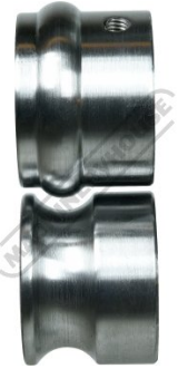
1.2 12.7mm Beading Dies