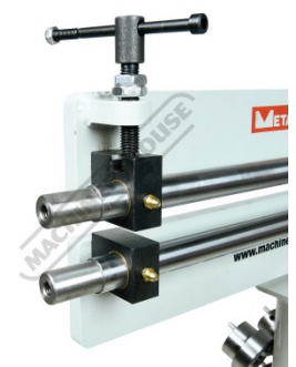
22mm Spigot for Mounting Rollers