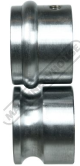
3.8 9.5mm Beading Dies