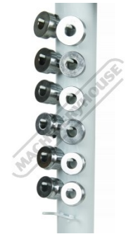
Rolls Stored on Stand