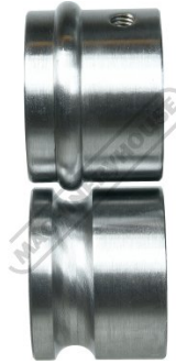
1.4 6.35mm Beading Dies