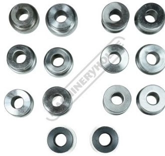
Die Sets Top View 2