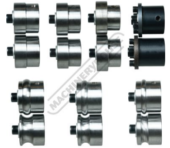
Side Profile View Of Die Sets