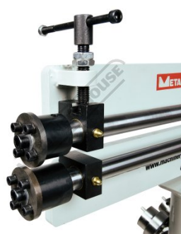
Shown With Shearing Dies