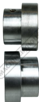
1.4 6.35mm Stepped Dies