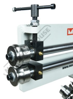
Shown With 1.2.12 Beading Dies