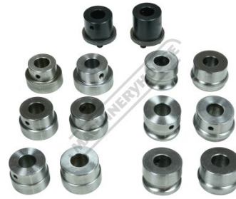
Includes 7 Sets of Dies