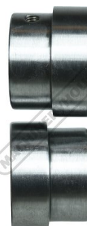
1.8 3mm Stepped Dies