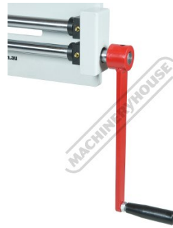
Manual Hand Wheel