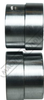
1.16 1.6mm Stepped Dies