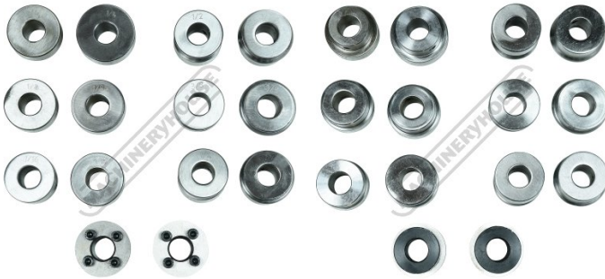
Die Sets Top View