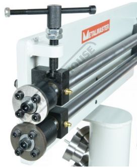
Top Roll Height Adjustment Handle