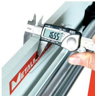
16mm Plate Steel