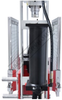
Side View Safety Guards