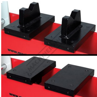
Vee Blocks Shown