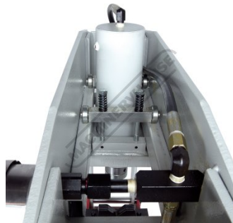
Ram Top View With Bearing Slide