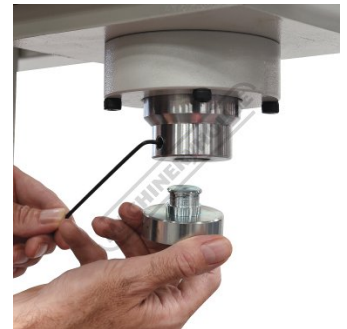
Includes Removable Ram Top Cap