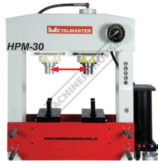
Horizontal Sliding Ram