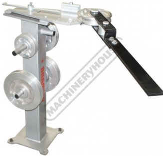
Optional stand to suit (K8422)