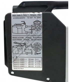
Force Adjustment Chart