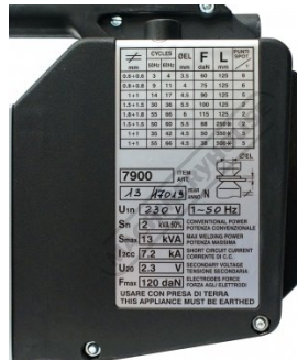
Specification Chart Weld Capacity