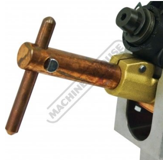
Top Electrode Holder