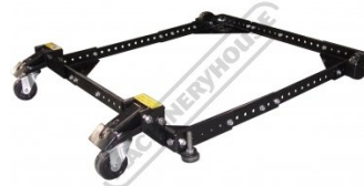
Includes Mobile Base (W930)