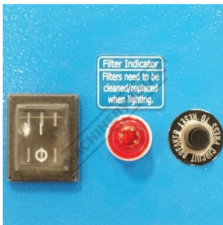
Filter Replacement Indicator