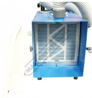
Easy Access to Filter