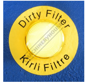
Dirty Filter Light Indicator