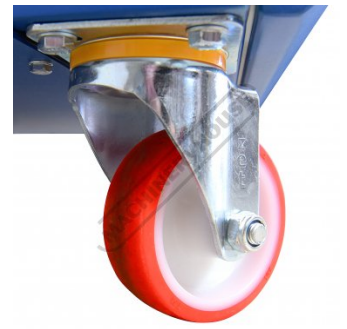
2 x Swivel Wheels