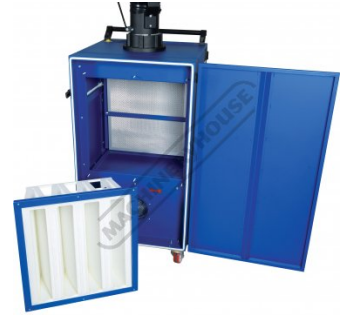
H13 Hepa Filter