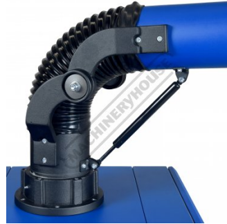
Exo Joint With Gas Strut Support