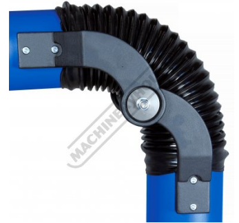
Exo Centre Arm Joint