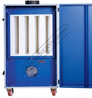
Front Door Access Panel