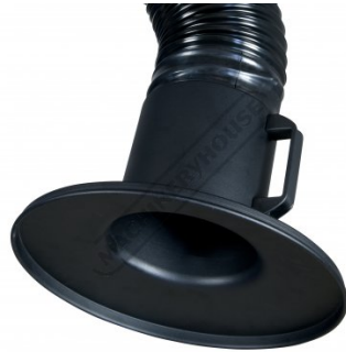
Fume Extraction Head