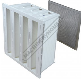
Dual Stage Filter System