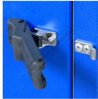
Quick Action Door Panel Locks