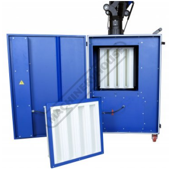
Dual H13 Hepa Filter