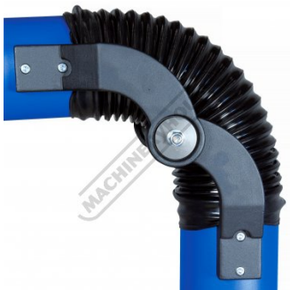
Exo Centre Arm Joint