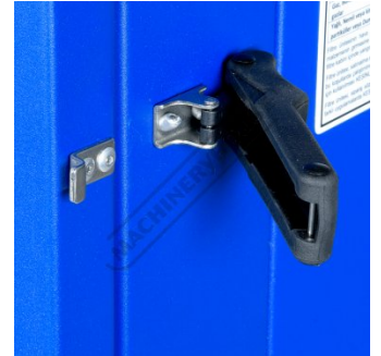
Quick Action Door Panel Locks