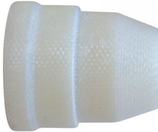
C626 Retaining Cup