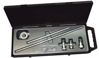
C660 Plasma Circle Cutting Kit