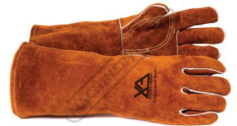
Professional Leather Welding Gloves