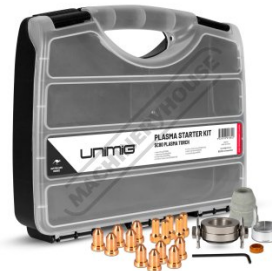
SC80 Plasma Torch Consumable Kit