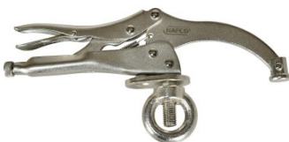
C103 228mm Multi-Purpose Locking Clamp