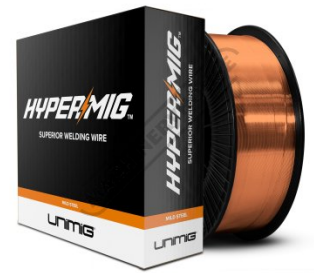
Mild Steel 5kg