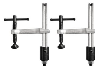
W08512 Weld Clamps with Locking Nuts (2 Piece Pack)