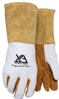
W101 TIG Welding Gloves - 310mm