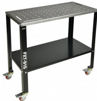
W08450 FIXTURE TABLE