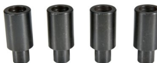
W08515 38mm x M12 Multi-Purpose Riser/Stops (Spigot Type) - 4pc Pack