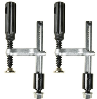
W08510 Weld Clamps with Locking Nuts (2 Piece Pack)