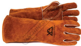
Professional Leather Welding Gloves