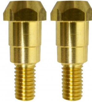
W557 2 Contact Tip Holders