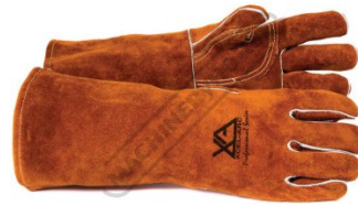
Professional Leather Welding Gloves