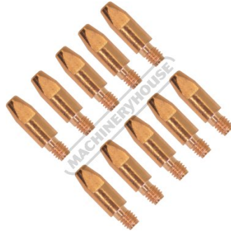
Contact Tips 0.9mm