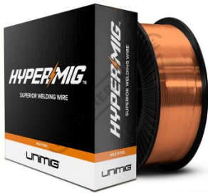
Mild Steel 5kg