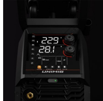
HD Backlit Interface