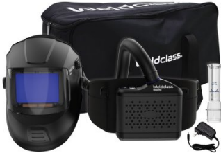
K84527 Welding Helmet with PAPR Respirator