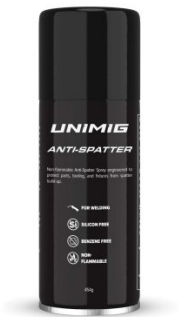
W119 Anti-Spatter Spray