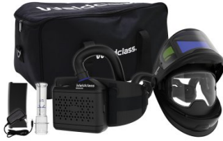
K84528 Welding Helmet with PAPR Respirator - Flip-up Lens