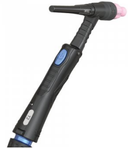
W171F Air Cooled Arc Torchology® TIG Welding Torch