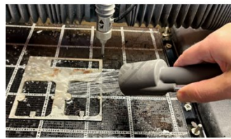
Wazer Pro Water Nozzle