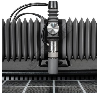
Cutting Head Inside Front View