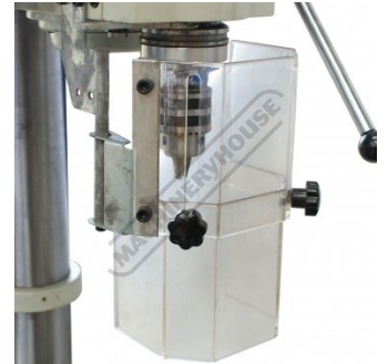
Interlocked Spindle Safety Guard