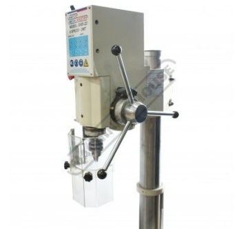
Head Right View