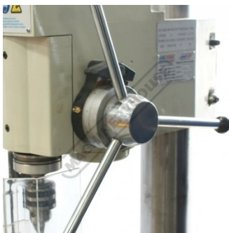
Drilling depth stop setting with scale