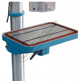
T Slotted Work Table Rotates 360 Degrees