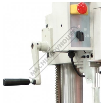
Rack and pinion wind up drill head