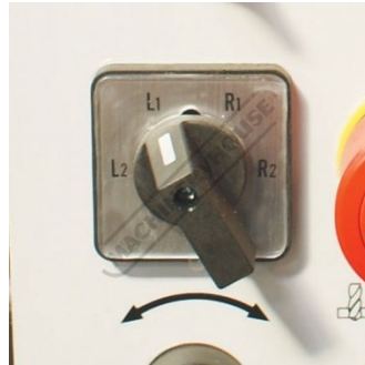
High Low with Forward and Reverse Switch