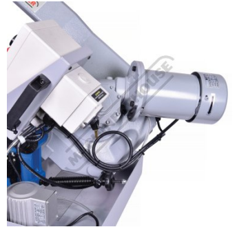
Variable Speed Motor and Gearbox