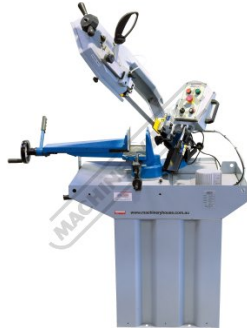
Swivel Head at 60 Degrees