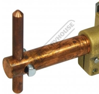
Bottom Electrode Holder