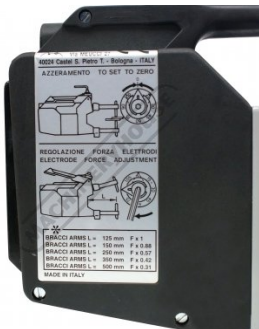
Force Adjustment Chart