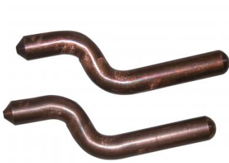
W035 TECNA 7900 Bent Electrodes