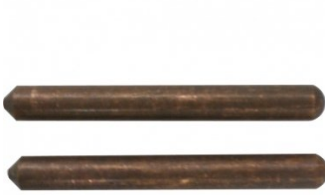
W034 TECNA 7900 Straight Electrodes