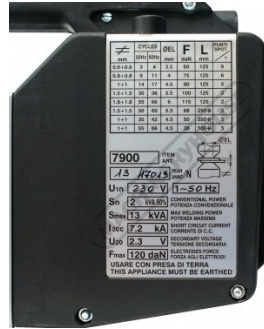
Specification Chart Weld Capacity