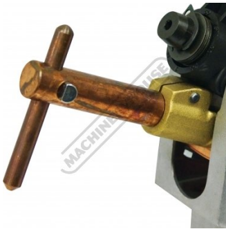
Top Electrode Holder