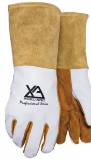
W101 TIG Welding Gloves - 310mm