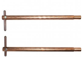
W032 TECNA 7900 Arm Set 350mm