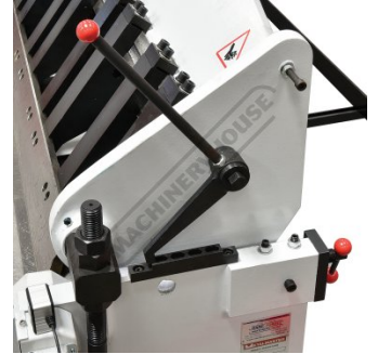
Top Beam Support Stop Lever and Thickness Adjustment Handle