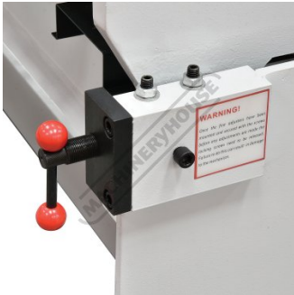
Quick Head Adjustment Handle for Material Thickness