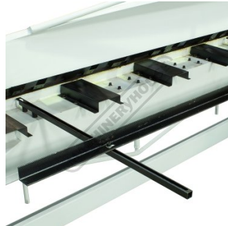
Rear Manual Backgauge