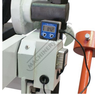
Digital Angle Readout