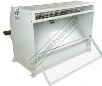
Rear Guard Pivots to Open