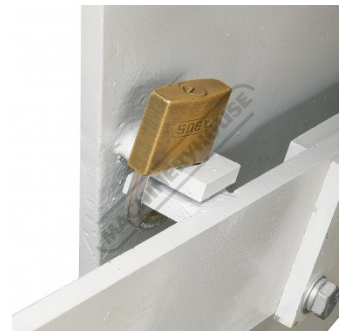
Isolation Tabs Shown Locked with Optional Padlock