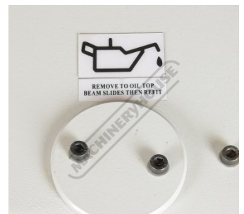
Oil Refil Points