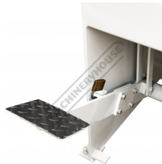
Foot Pedal Lever Shown Locked with Optional Padlock