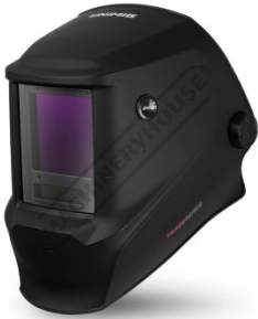
Series Welding Helmet Black