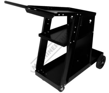
Small Machine Welding Trolley