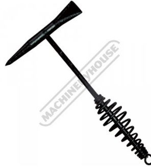
UMCH HD Chipping Hammer