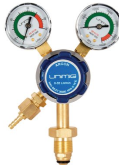
W160A Argon Gas Regulator-Twin Gauge