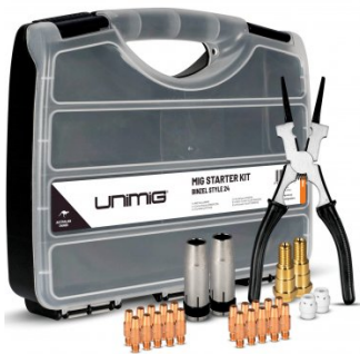
W496 SB24 Mig Torch Consumable Pack