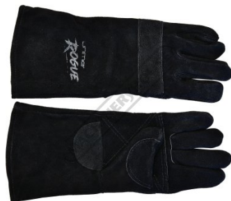
Front and Back View