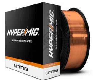
Mild Steel 5kg