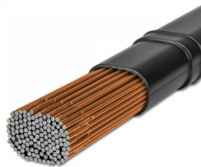
W125 Ø1.6mm TIG Filler Rod - Mild Steel