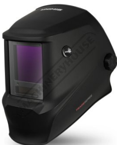
Trade Series Welding Helmet