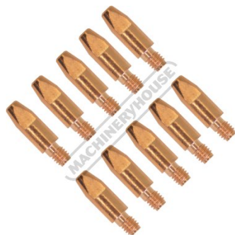
PCT0009 08 10x0.8mm Contact Tips