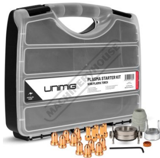
Plasma Starter Kit