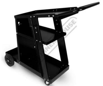
Small Machine Trolley