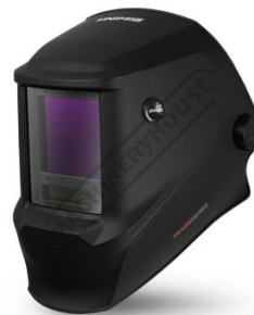
Trade Series Welding Helmet