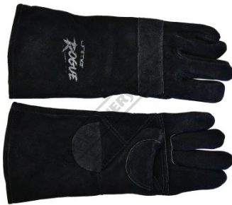
Front and Back View