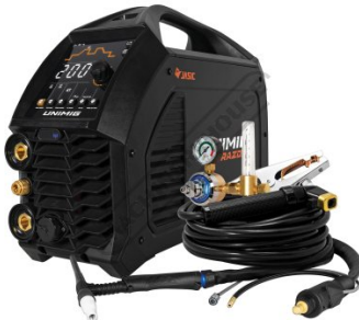
RAZOR TIG 200 ACDC WELDER