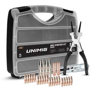
W501A M350 MIG Torch Consumables Starter Kit