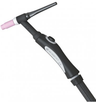
W171 Air Cooled TIG Welding Torch