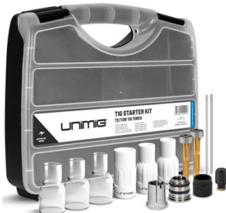
W504A T2 Tig Torch Consumable Pack