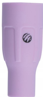
W5991 Ø10mm Ceramic Nozzle