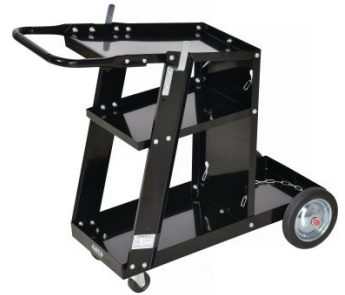
W241 Universal Welder Trolley