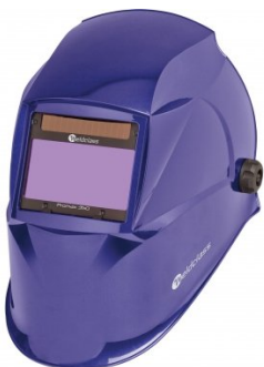
W002 Auto Darken Welding Helmet - 9-13 Shade