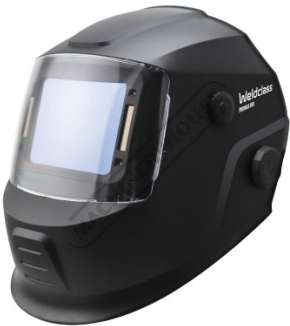
PROMAX 650 Auto Darkening Welding Helmet