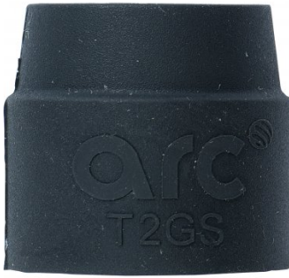
W5996 Head Gasket