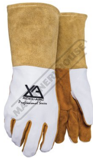
UMWG3 TIG Welding Gloves 310mm