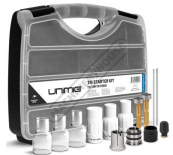
UMSKT2 T2 Tig Torch Consumable Pack