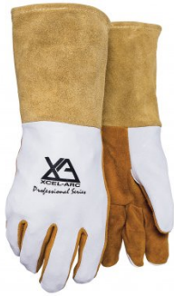
W101 TIG Welding Gloves - 310mm