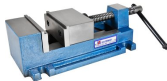
V141 Safeway Precision Drill Press Vice