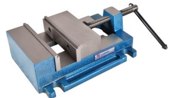
V143 Safeway Precision Drill Press Vice