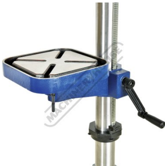
Table with Rack and Pinion Wind Up