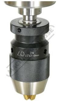
13mm Keyless Drill Chuck