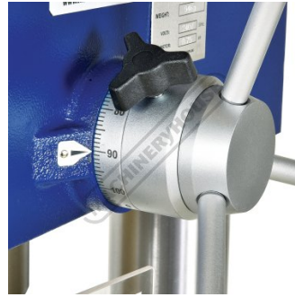
Drill Depth Setting with Scale