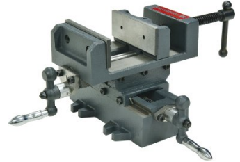
V1204 Compound Drill Vice