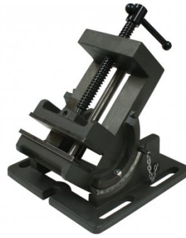
V114 Tilting Drill Press Vice