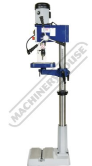
Rack and Pinion Fully Up