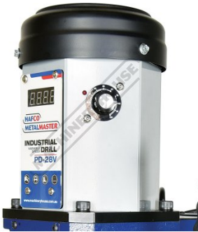
DC Brushless Motor