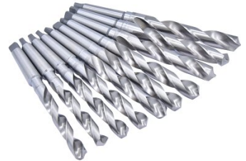
D119 Metric 2MT HSS Drill Set