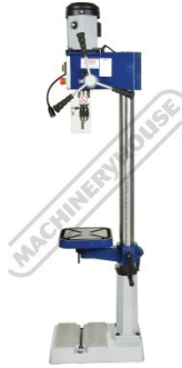
Rack and Pinion Fully Down