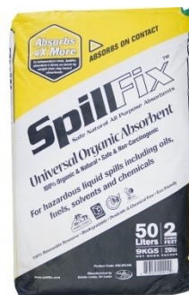
O000 SpillFix Universal Organic Absorbent