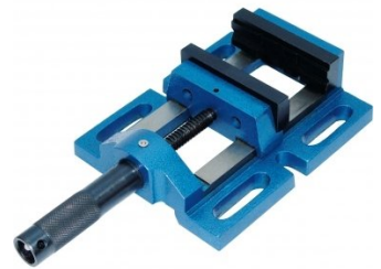
V144 Drill Press Vice