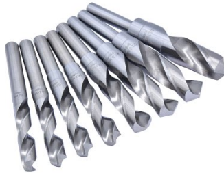
D117 Metric HSS Reduced Shank Drill Set