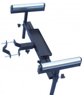
W3425 Drill Press Roller Support