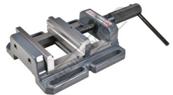
V1451 130mm Drill Press Vice