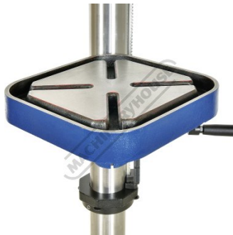
Cast Iron Table Rotates 360 Degree