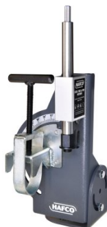
P090 Pipe & Tube Notcher Attachment