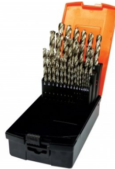
D1282 Imperial 135° Precision HSS Drill Set - 29 Piece