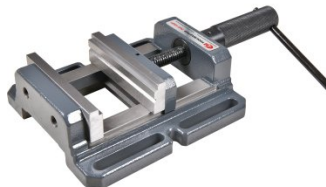
V1451 Drill Press Vice