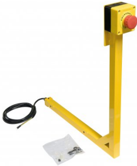
D201 Knee Stop Switch with Bracket & 3M Lead