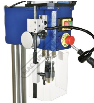
Drill Chuck Safety Guard with Micro Switch