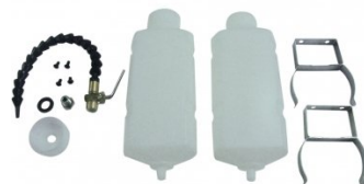
P220 Gravity Feed Coolant System