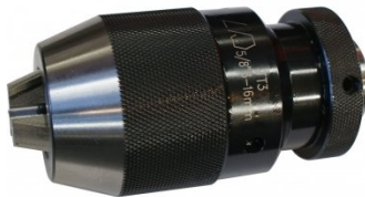
C294 Industrial Drill Chuck - Keyless Type