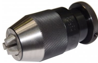
C292 Industrial Drill Chuck - Keyless Type