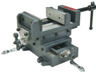
V1205 Compound Drill Vice