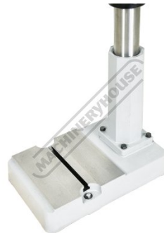
T Slot Base