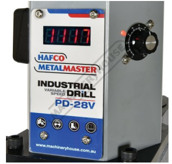
Variable Speed Readout with Adjustable Dial