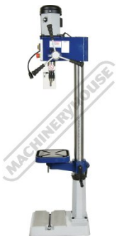
Rack and Pinion Fully Down