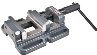
V1441 Drill Press Vice