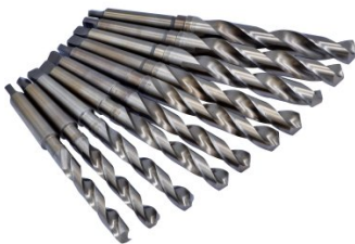
D122 Metric Precision 2MT Morse Taper Drill Set - 10 Piece