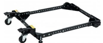
W930 Mobile Base