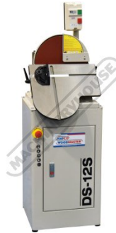
Table Shown Tilted