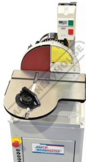
Top View Of Table