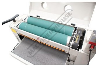
Top Guard Open